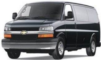
Express Cargo Van 1500 • AWD LS • 22" 09CPE00041 • Black 41